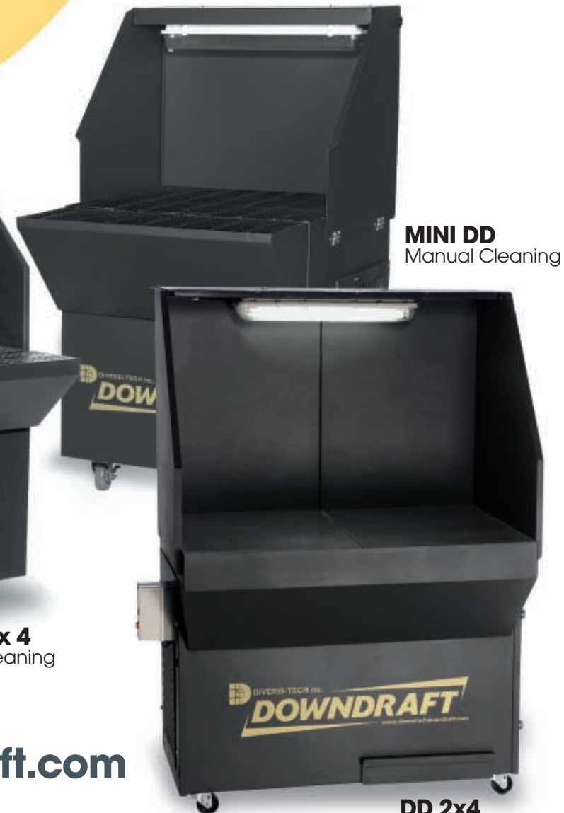
MINI DD Manual Cleaning