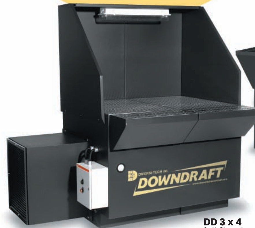
DD 3 x 4 Self Cleaning