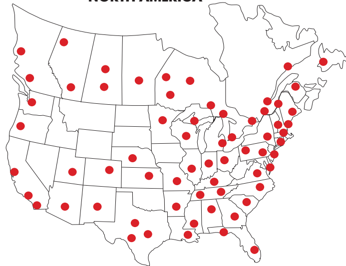
DISTRIBUTORS ACROSS NORTH AMERICA